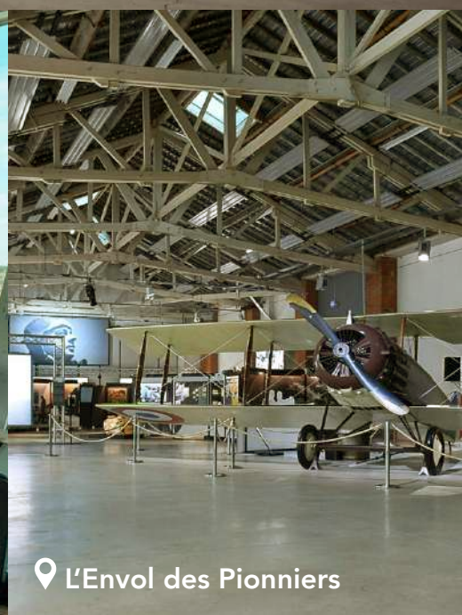
L'Envol des Pionniers