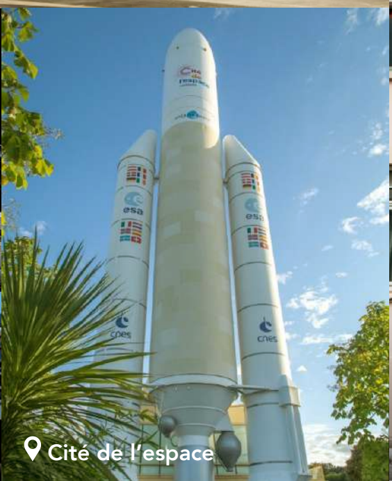
Cité de l'espace